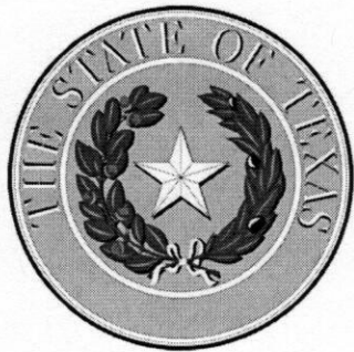
GREG ABBOTT, GOVERNOR OF TEXAS